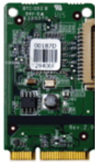
Full-size PCIe Mini