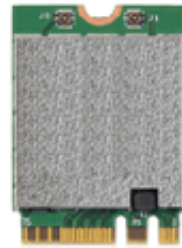
M.2 A key